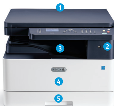
Xerox® B1022 Multifunction Printer

9 The Xerox® B1025 features a larger 4.3-inch colour touchscreen interface for added simplicity.