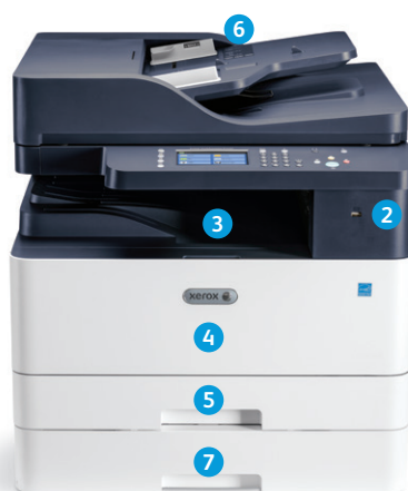
Xerox® B1025 Multifunction Printer

DADF configuration shown with optional additional tray.